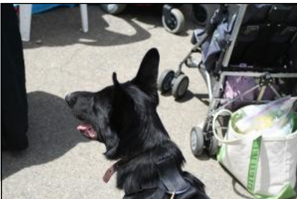
July 4th - watching a parade

DO know that swimming is REALLY fun! I can not wait to go again. We also have had some other excursions in June including going to the park to work on my obedience skills and to play. My pup sitter and I have fun mixing my "training" and play times together. To me it makes it so much