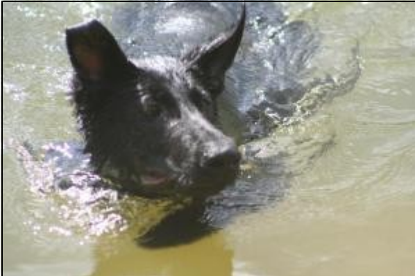
June - swimming

well on my first try. My pup sitter is still bragging that I never splashed about like many dogs do their first several times swimming. I think she called it a doggy paddle. Anyway she keeps smiling when she tells people that I immediately knew how to make my butt float which seems to be a big deal when it comes to swimming. I do not really know but I