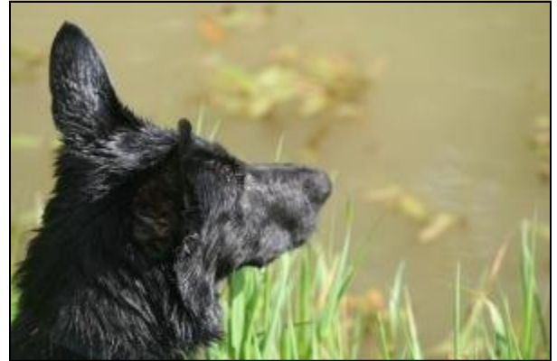
June - swimming

July was another fun month but I will keep it short. I went to the park a couple more