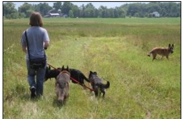
July - meet-up in New York

Well that should about wrap up this writing of my adventures.