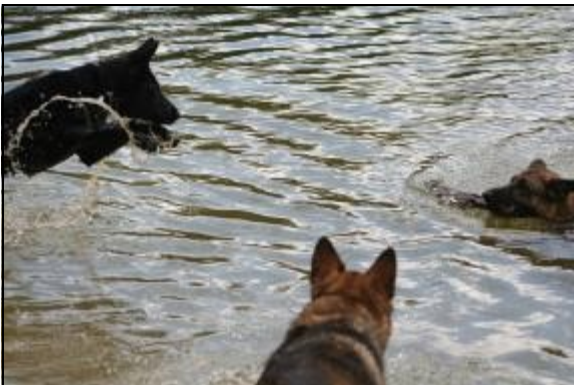
June - swimming with Chimo and Rayne

June brought around some changes in the household as we had to become accustomed to a hole in the Paq after loosing KC. She was one of my doggy mentors and I learned a lot from her in the brief time we were able to spend together. My pup sitter said I have been showing a lot of the good characteristics that she always loved about KC. That makes me feel good because