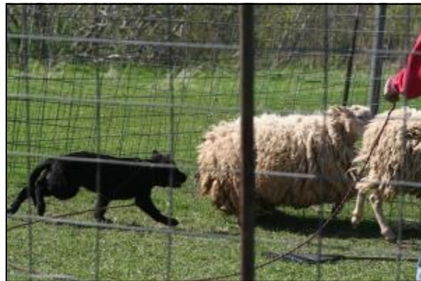
June - herding sheep

trip there I have to agree. It is a very special place with open fields that we can run and play in and a beautiful pond. It was just after my 5 month